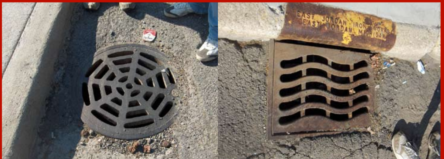
Examples of storm drains down McKinley at Ball State University

Our original idea was to design a professional logo, slogan and eye-catching phrases to be painted around drains located on campus. This phase was supposed to focus on stenciling curb-side drains, but we hoped to expand the project to the many different types of drains throughout campus and work with the Muncie Delaware Stormwater Management to paint throughout Muncie and Yorktown as well.